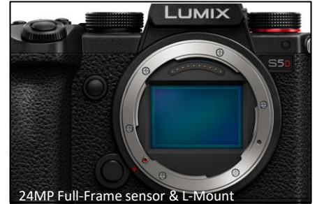
24MP Full-Frame sensor & L-Mount